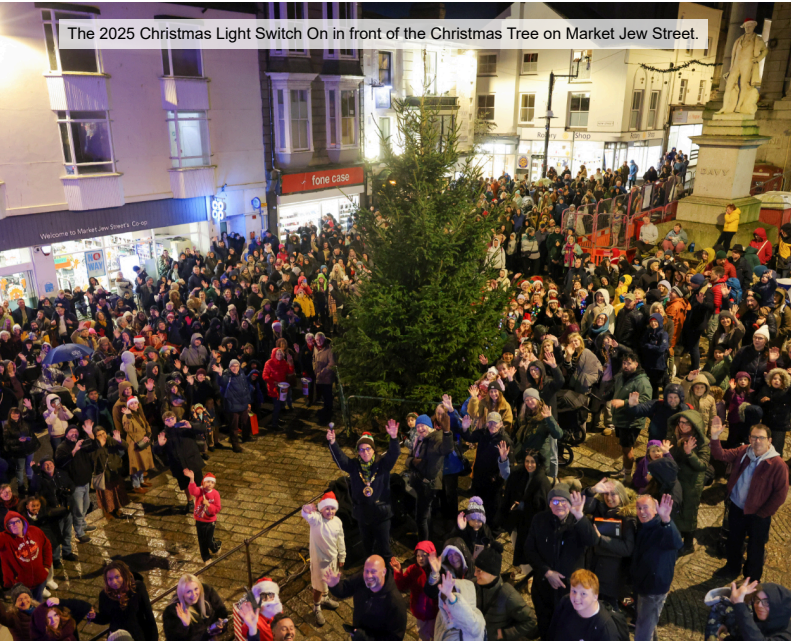
The 2025 Christmas Light Switch On in front of the Christmas Tree on Market Jew Street.