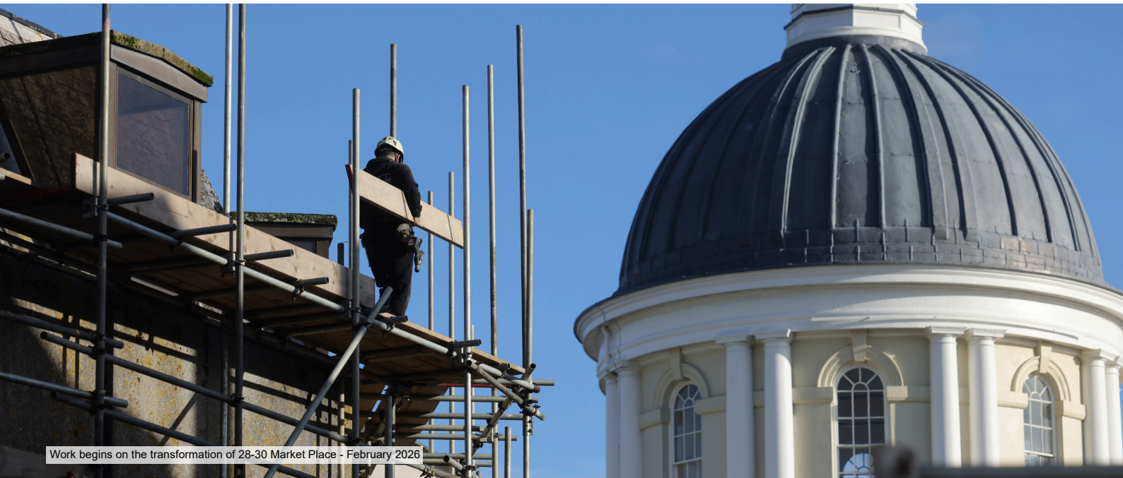
Work begins on the transformation of 28-30 Market Place - February 2026

In the municipal year 2025/26, Penzance Council's Planning Committee considered around 200 planning applications at 17 meetings, including unanimously objecting to a planning application for retirement apartments at the former Lidl site at Wherrytown.