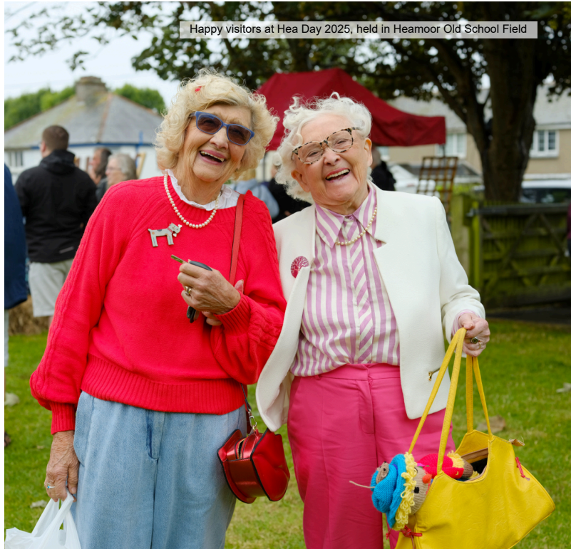
Happy visitors at Hea Day 2025, held in Heamoor Old School Field

The field has been well used by various community groups in Heamoor to host fetes and community days and we hope to continue to work collaboratively with local groups to ensure the best continued use of the space.