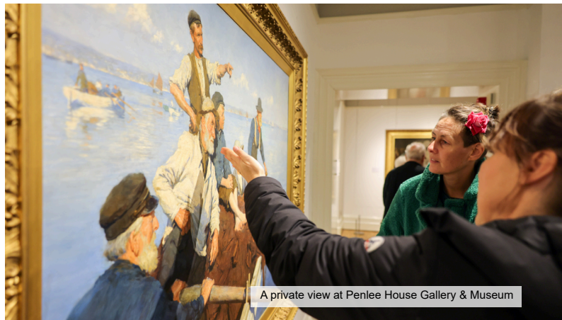
A private view at Penlee House Gallery & Museum

Admission is free for everyone who lives within the Parish of Penzance. Please bring along proof of address to receive your pass.