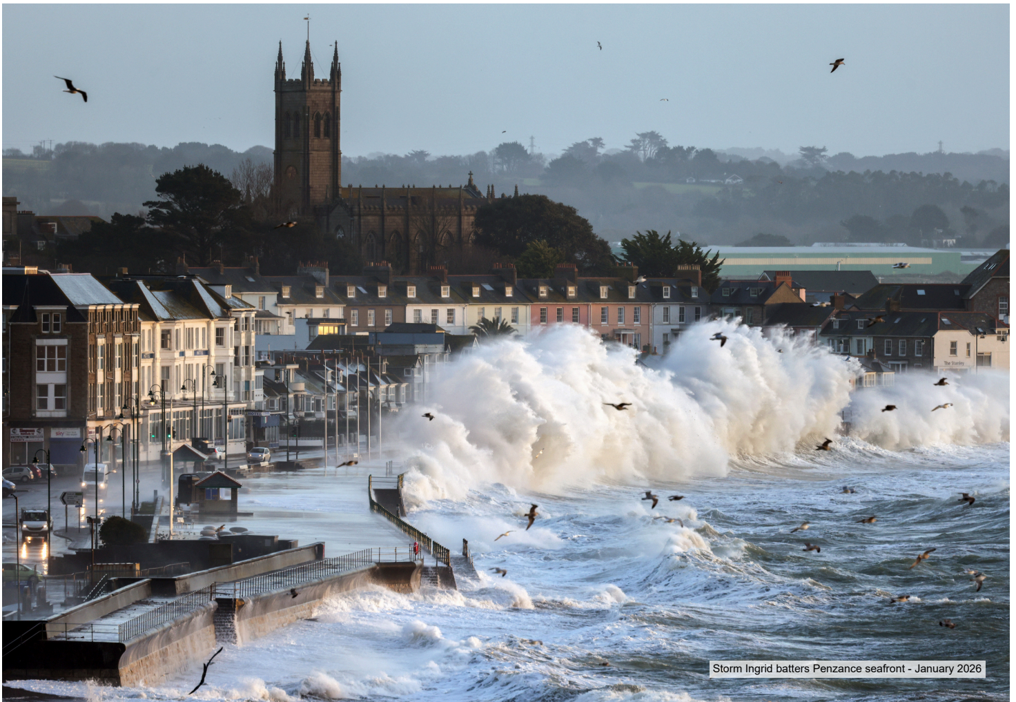
Storm Ingrid batters Penzance seafront - January 2026

However, regardless of whether Penzance is shortlisted or not, the process has already initiated valuable conversations about how to develop and celebrate the cultural offering of our unique town.