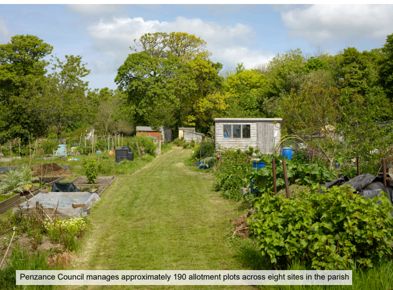
Penzance Council manages approximately 190 allotment plots across eight sites in the parish

An analysis of our allotment pricing was undertaken in 2025 and it was established that after many years of the allotment pricing remaining unchanged, price increases would need to be brought in for the 2026 renewal to retain the financial stability of Penzance Council's allotment provision. This also brings us in line with comparable allotment pricing of neighbouring councils.