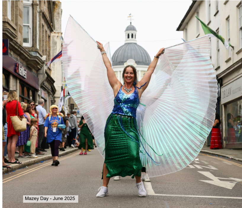
Mazey Day - June 2025

The work of Sustainable Penzance is closely aligned to the Council's Strategic Plan and contributes to the delivery of our Climate Emergency Action Plan.