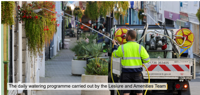
The daily watering programme carried out by the Leisure and Amenities Team

The reasons behind the expansion are varied. However, as Penzance Council is being asked to take on more responsibility from Cornwall Council within the parish on a year-on-year basis, efforts are being made to try and ensure that Penzance Council remains in the best position to take on these responsibilities and to deliver the improvements that are being requested of us.