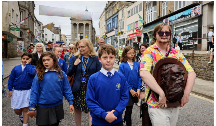
Pupils from St Mary's C of E School join the parade as the head of St John is carried.