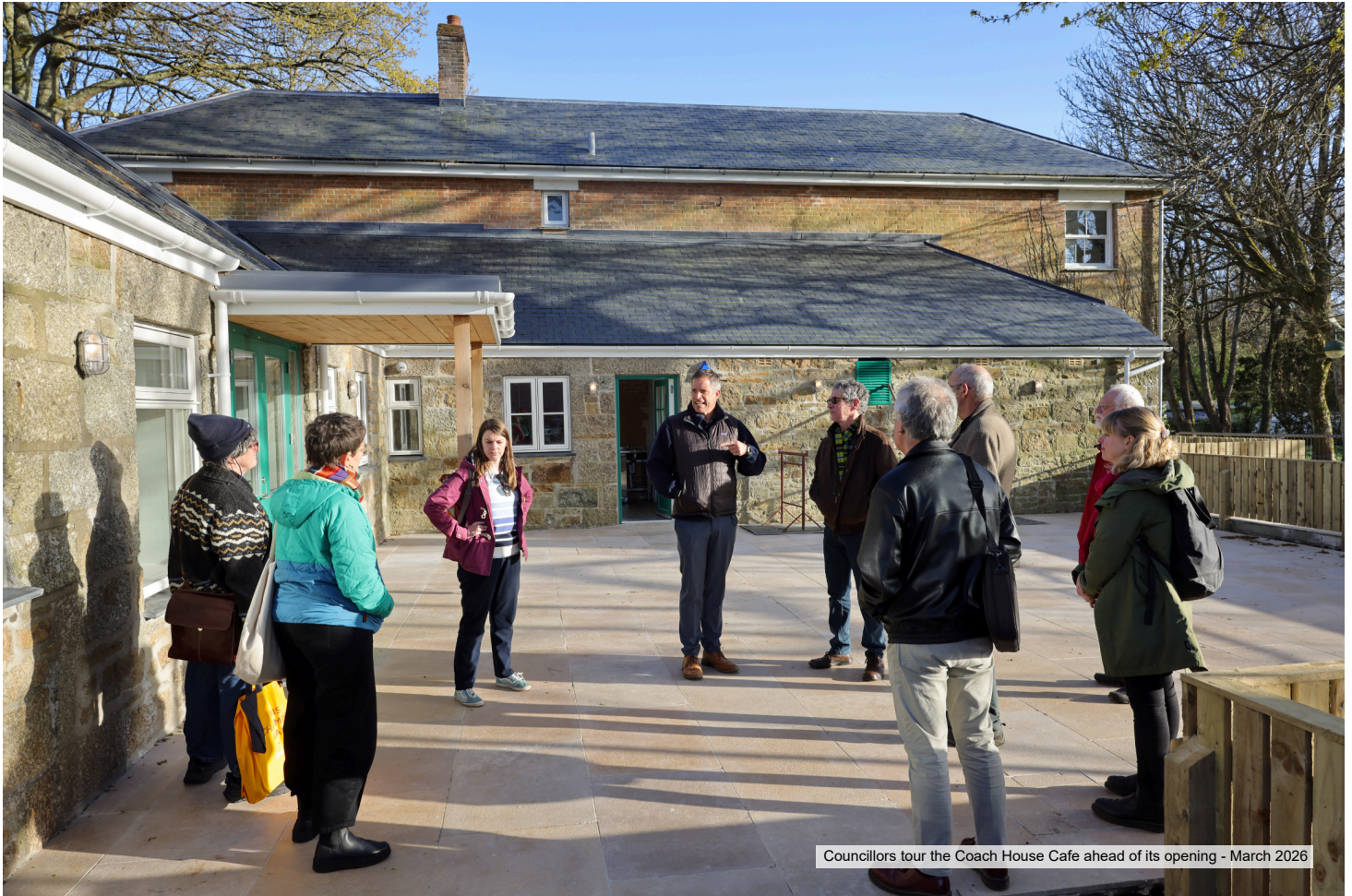
Councillors tour the Coach House Cafe ahead of its opening - March 2026