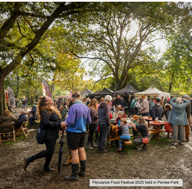
Penzance Food Festival 2025 held in Penlee Park.

Penlee Park also hosted the new Community and Family Area during Golowan Festival 2025, offering engaging activities and entertainment for all ages. The addition of this space to the Golowan programme was an overwhelming success with the area well attended across the weekend and positive feedback received from a number of different user groups.