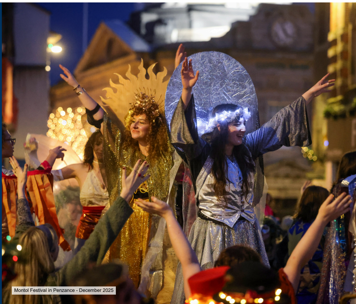
Montol Festival in Penzance - December 2025

To make the community (of Penzance Council) a better place to live, work and grow.