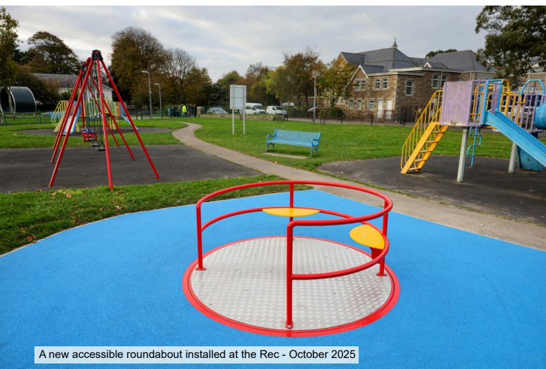
A new accessible roundabout installed at the Rec - October 2025

Initial consultation with residents and users of the recreation ground took place in 2025 and Penzance Council will look to include this feedback into the future planning for the site.