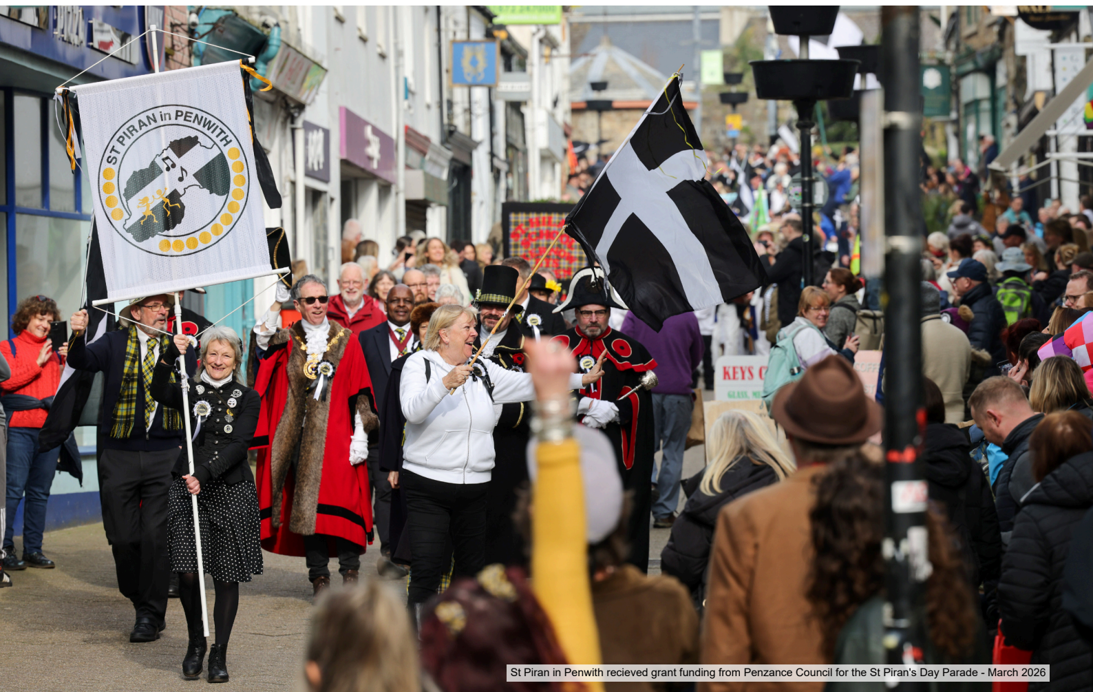
St Piran in Penwith received grant funding from Penzance Council for the St Piran's Day Parade - March 2026

As Band D falls in the middle of the eight Council Tax Bands, it is the standard measure used by local councils to announce their precept. However, 80% of households in the Penzance Parish are Council Tax Bands A-C, which means the vast majority of households saw a real-terms increase of less than £1 per year.